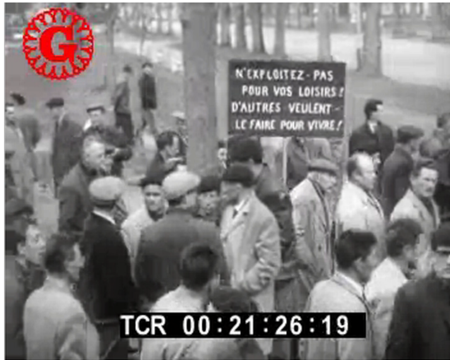
Still photograph from Gaumont News during the Gabin affair trial 14 – November 1964

However cleverly orchestrated, the media exposure was only the tip of the iceberg. A deep and increasing exasperation, reflecting the difficulties in recovering land, could be observed across many French regions, particularly in the West of the country. In these regions where sharecropping was dominant, the real core of the issue was not so much land ownership as land use. The “Duval-Lemmonier” affair was a perfect demonstration of this. As with the Gabin case, farmers invaded the home of a landowner. Having just acquired a grazing pasture, he had not renewed the lease of the tenant who worked/exploited it. Contacted by telephone, the landowner refused to change his decision. The intruders caused major damage. This incident was but one among a string of mobilizations which shook the departments of Manche and Orne from the winter of 1961-1962 onwards. In this particular case, the tensions were crystallized by the practice of “ bannies ” which were the annual allocation of pastures. The uncertainty created by this annual cycle jeopardized the increase in farmed surfaces so necessary to the expansion or creation of farms. 15 Faced with