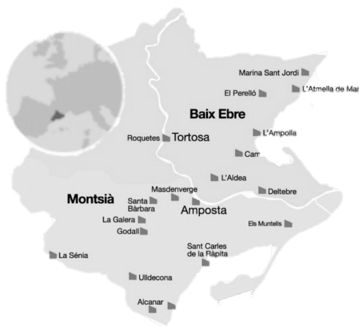
Figure 1: Map of the Lower Ebro Region

This paper analyses social conflicts in southern Catalonia, specifically the regions of Lower Ebro and Montsià, both located on the mouth of the Ebro River in the province of Tarragona [Figure 1]. 4 These conflicts were carried out by rural wage workers and proletarianized small farmers who were able to resist and to challenge almost permanently the Francoist agents in the region and, as we shall see, they had a direct impact on weakening the local powers of the dictatorship. Apparently calm, the peasantry was, however, suffering the unwelcome consequences of the so-called developmentalist political economy of the 1960s: impoverishment, proletarianization, higher taxation, the necessity to migrate, etc. This led to conflicts not primarily centred on the property of land itself, but on control of the means of production and the final product of the peasants' labour. Franco's Nuevo Estado (New State) claimed to be the guarantor of "social peace" so strictly labour conflicts necessarily became larger political struggles, as the latter were defined as crimes in Francoist Spain. Thereby,